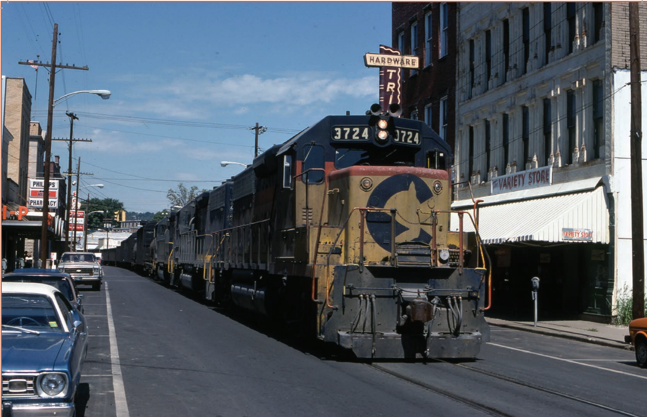
Led by former B&O GP40 3724, we see a variety of Chessie System power and predecessor power street running in St. Mary's, WV on 8/22/81.