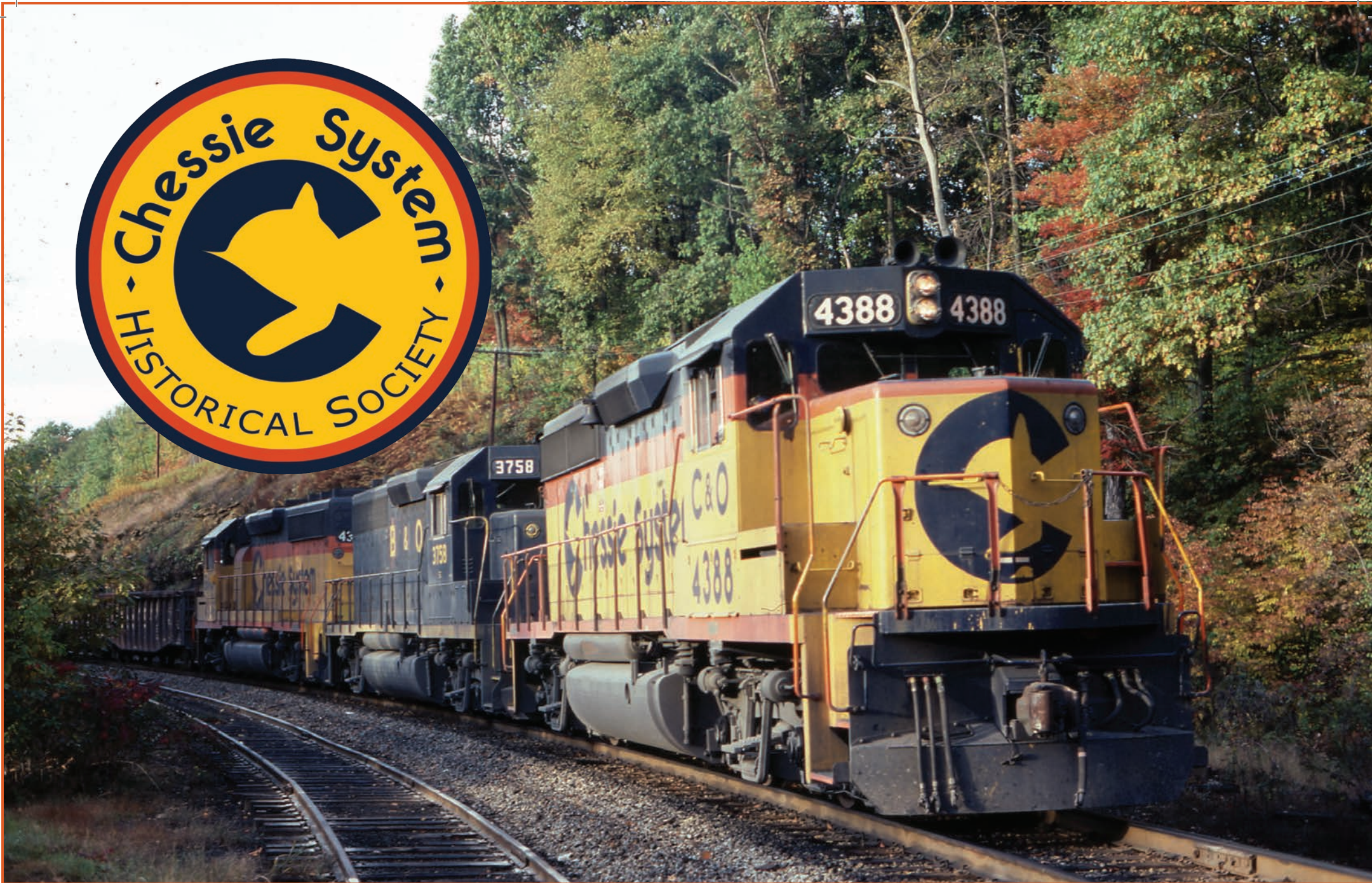
Chessie System GP40-2 4388, GP40 3758, and another GP40-2 are on the head end of a mixed freight barreling through Musgrove, PA on October 11, 1981.