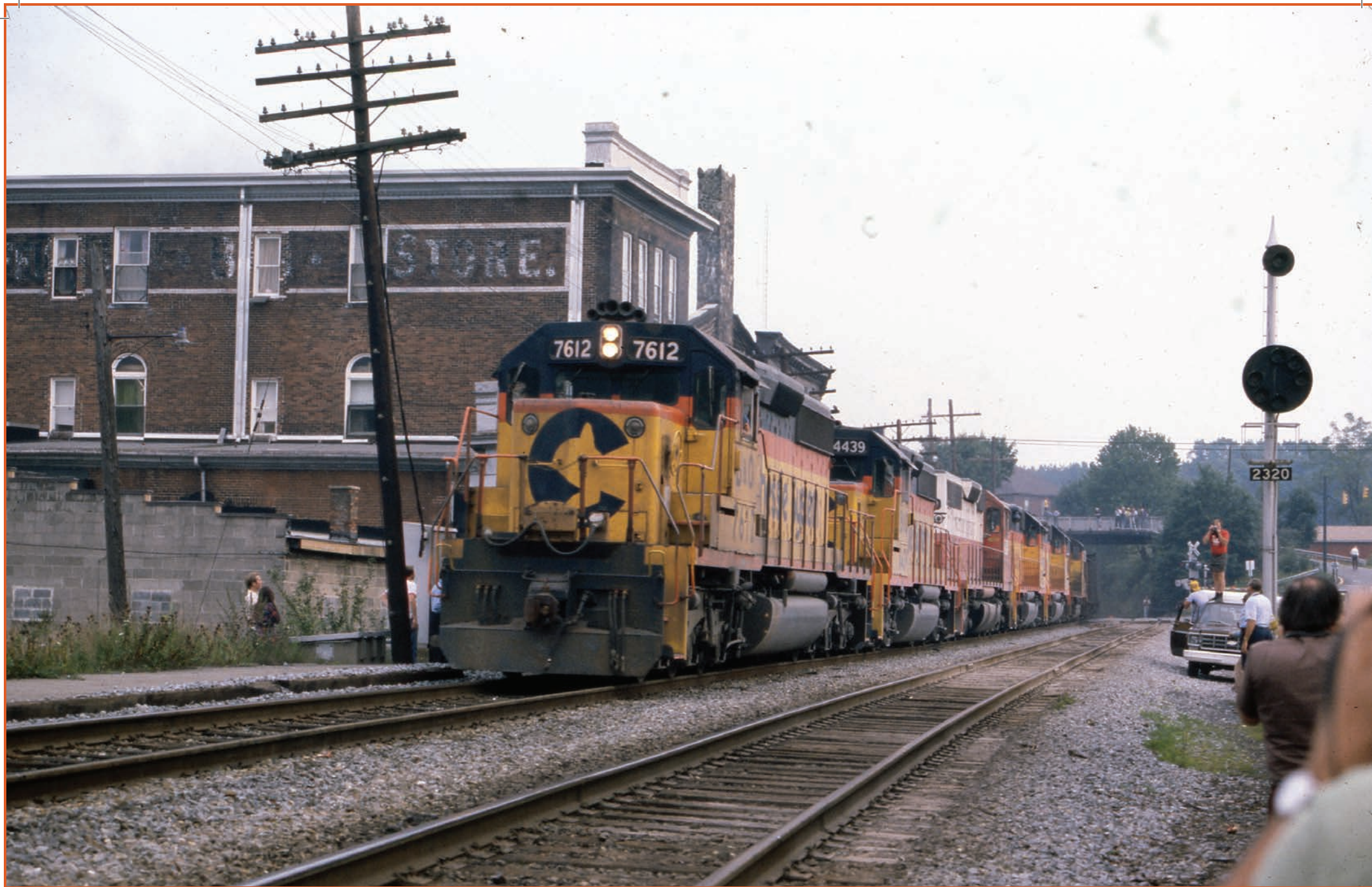
Three year old Chessie System SD40-2 7612 leads a big tonnage mixed freight westbound on the Mountain Sub through Oakland, MD in November 1980.