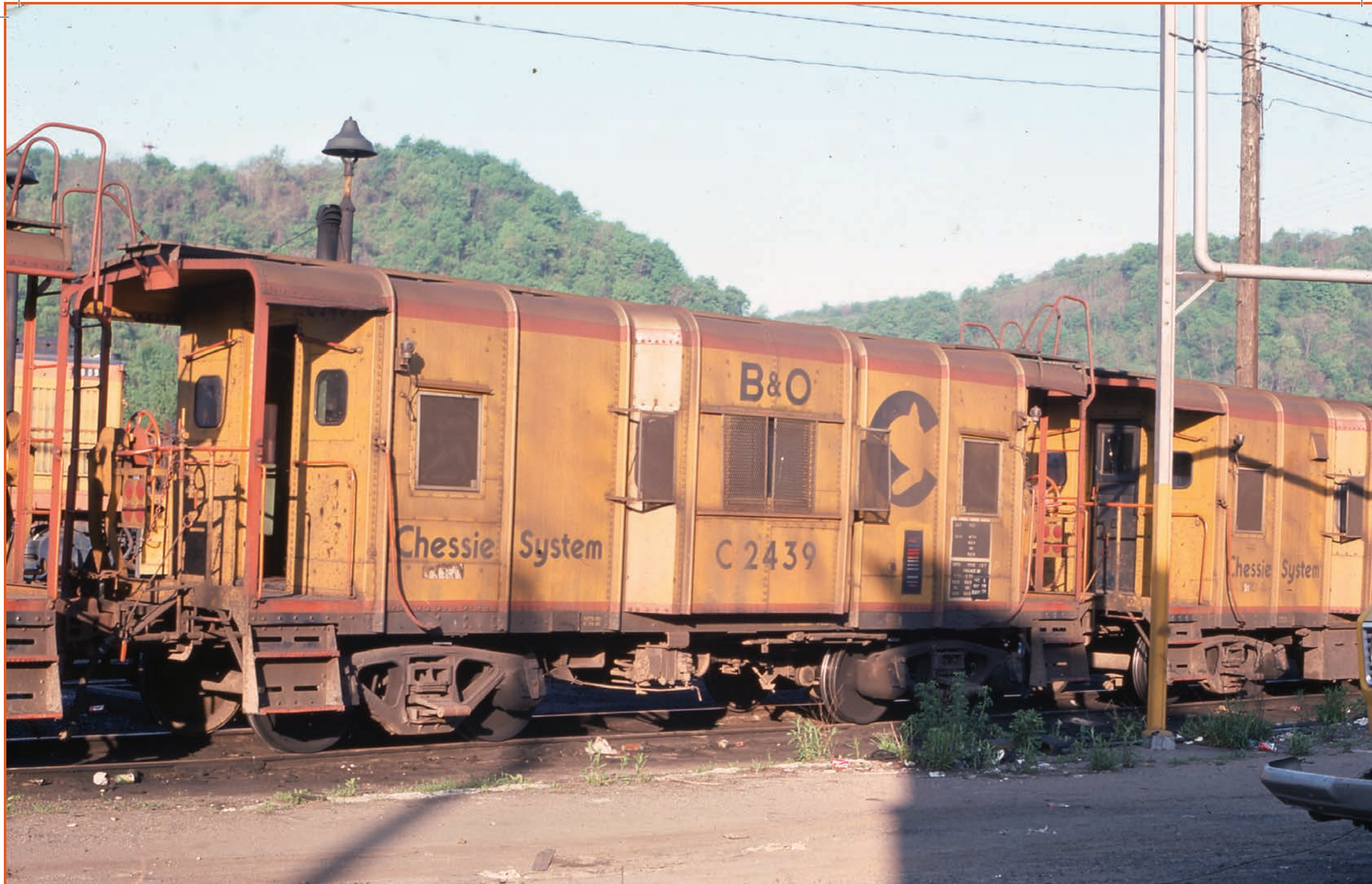
In May of 1976, we find 3 iconic C-18 (Chessie class) wagontop cabooses in the late afternoon sun at an unknown location. The B&O built 125 of these I-12 (B&O class) cabooses in 1941 (100) and 1945 (25).