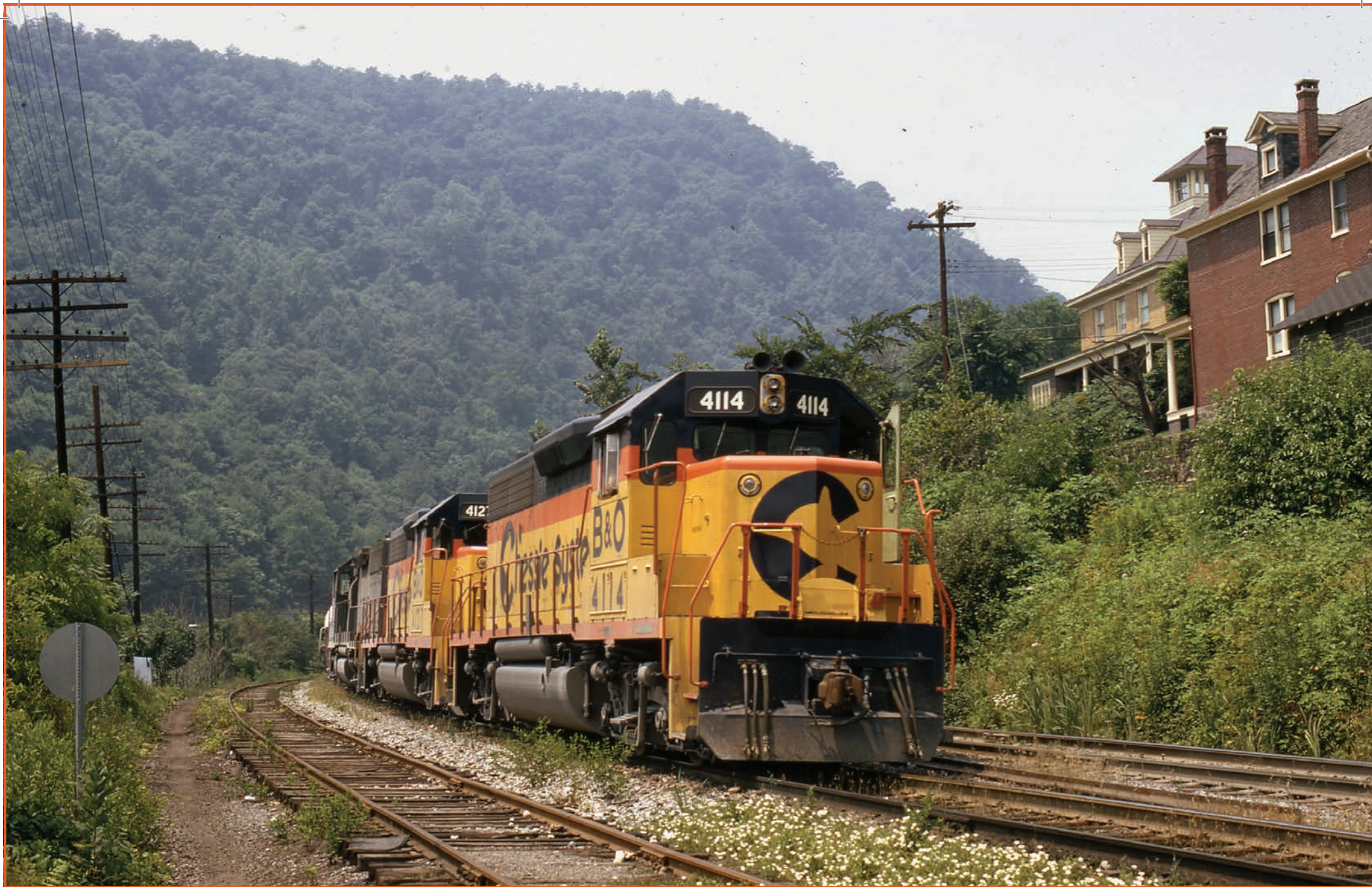
Coming into Cumberland, MD on a hot June day in 1978, Chessie System GP40-2 4114, leads an east-bound mixed freight into town. The GP40-2 was the jack of all trades for Chessie.