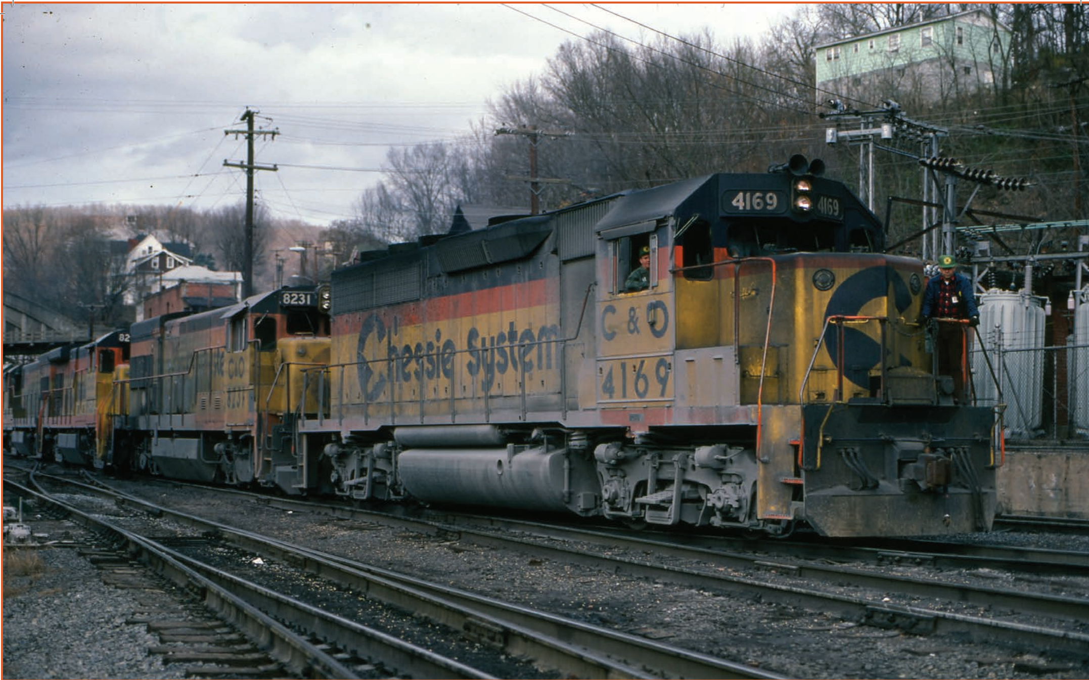
On a November day in 1979, Gary Larimer was able to photograph this set of Chessie System power in Hinton, WV. Covered in sand and coal dust one can assume that this quartet of power just hauled a coal train out of one of the many hollers in southern West Virginia.